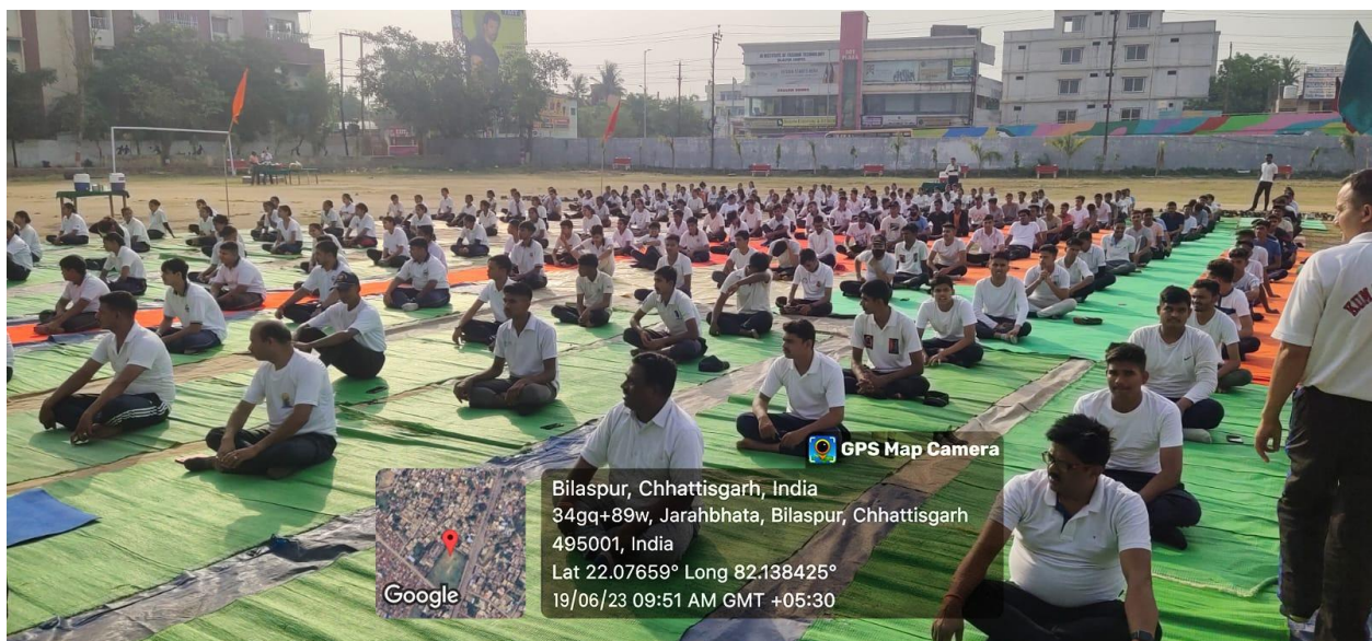
NCC cadets performing Yoga at Govt. J.P. Verma College Bilaspur on 19/06/2023