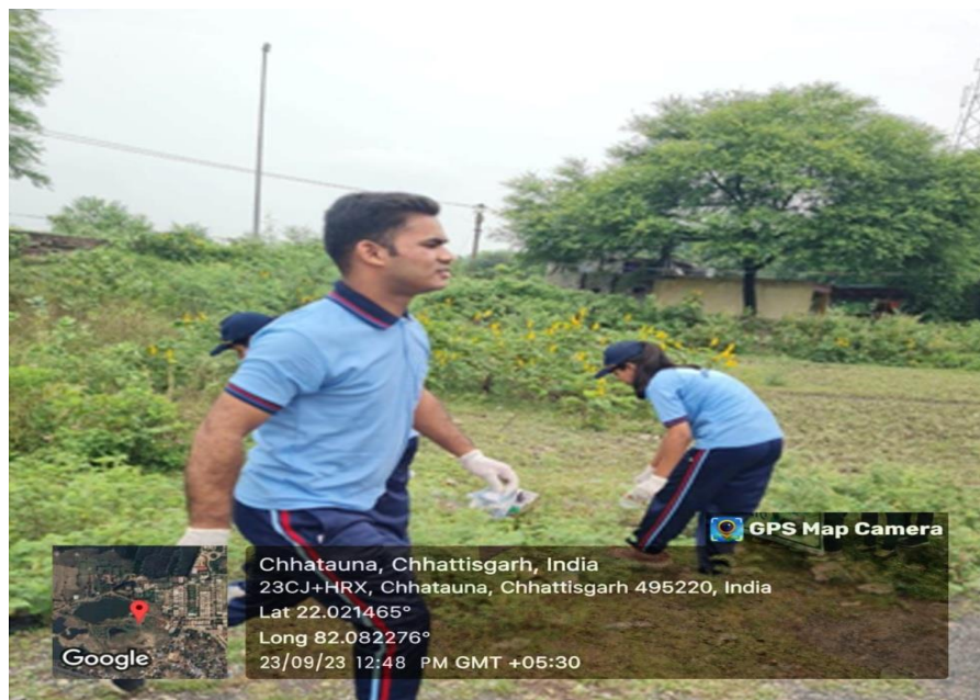
NCC Cadets of Lakhmi Chand Institute of Technology College cleaning the surrounding area near the pond.