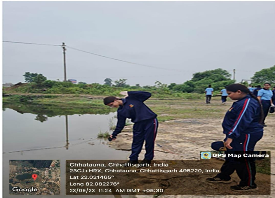
NCC Cadets of Lakhmi Chand Institute of Technology College performing cleanliness drive at pond near Indu imagica colony. Date:- 23/09/23