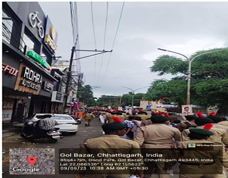
NCC cadets doing Rally near Gol Bazaar, Bilaspur.