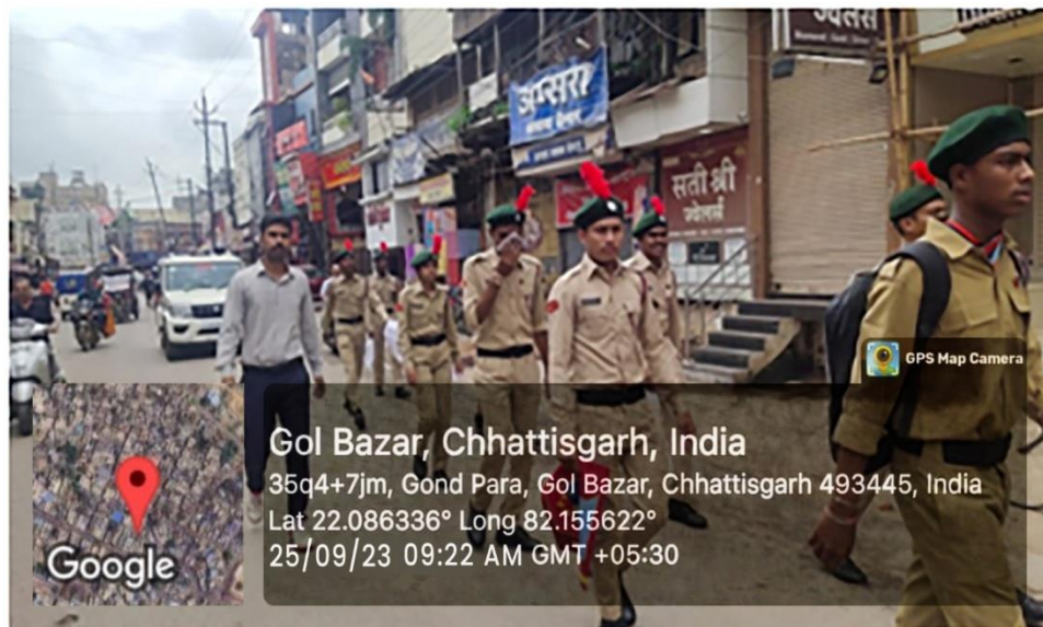
Rally organized by 7 CG Battalion NCC in the area of Gol Bazaar area to spread awareness about the harms of plastic bag to the shopkeepers and society.