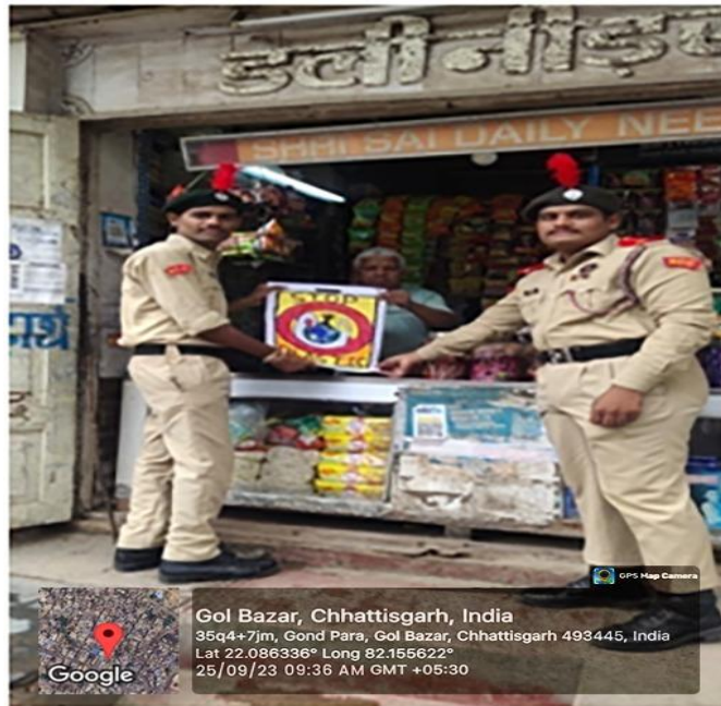
NCC cadets of Lakhmi Chand Institute of Technology College giving bags created with cloth to the shopkeepers of the Gol Bazaar.