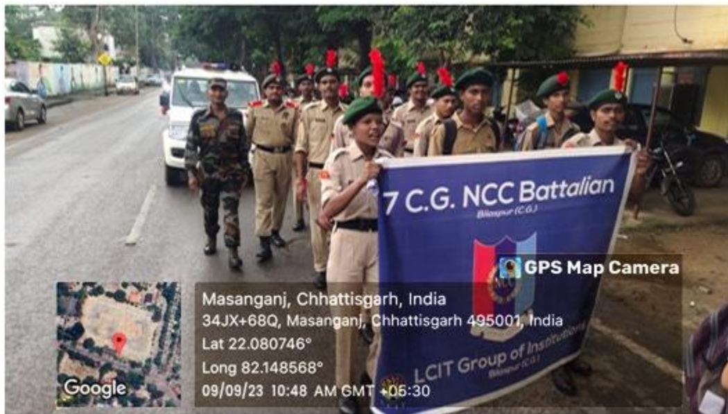
Rally organised by 7 CG Battalion NCC Bilaspur.....Lakhmi Chand Institute of Technology College NCC Cadets participating in rally near Police Ground.