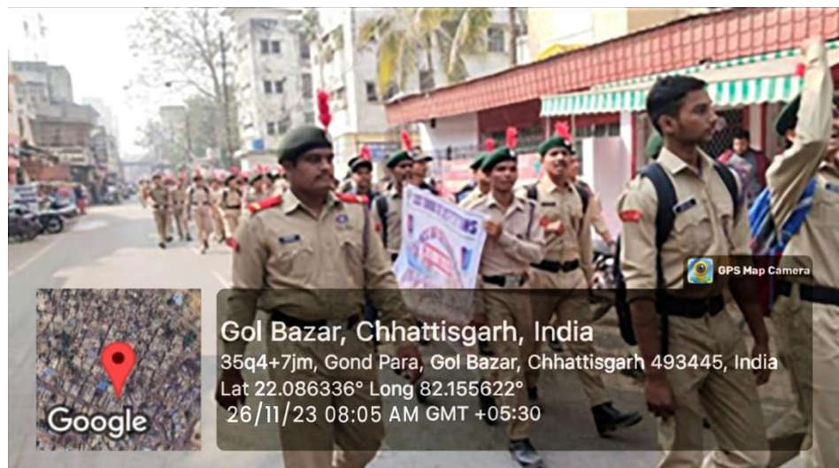
NCC Cadets of Lakhmi Chand Institute of Technology College at rally near CIMS Hospital Bilaspur