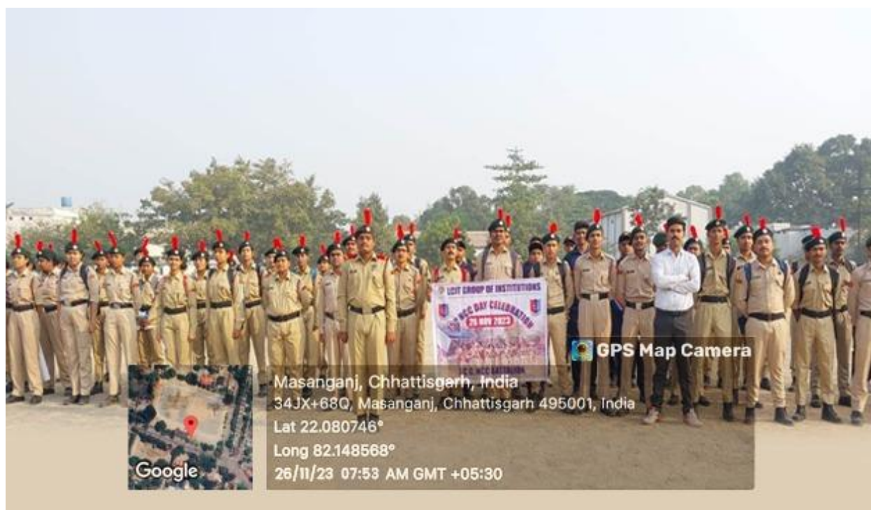
Cadets of Lakhmi Chand Institute of Technology College Gethered together in Police Ground Bilaspur before starting Rally.